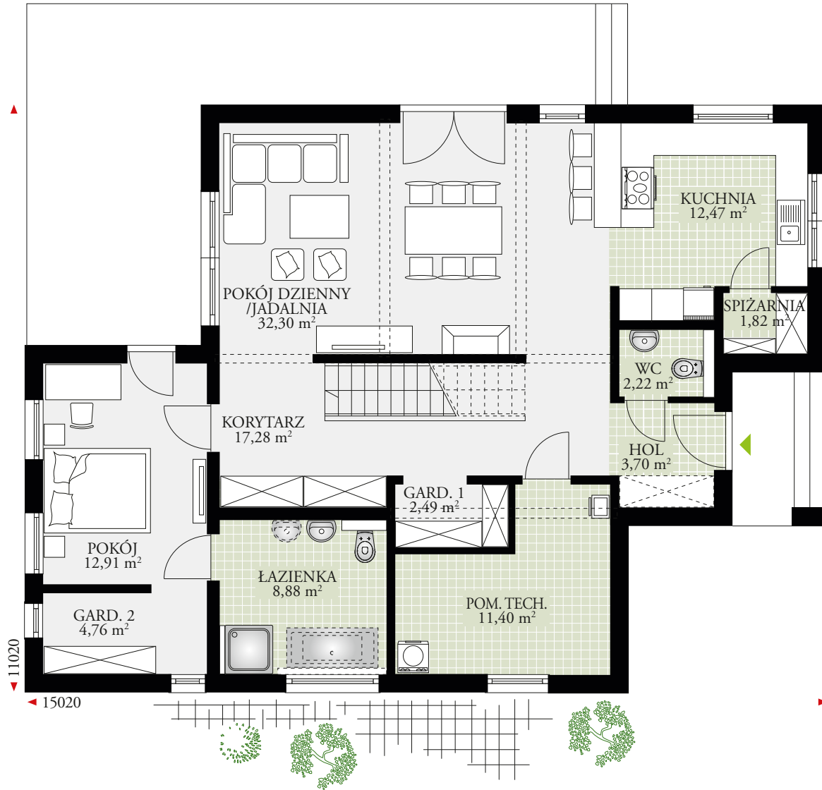
PARTER 110,23 m 2